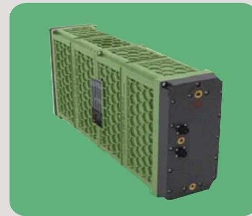
锂电池组 Lithium Battery