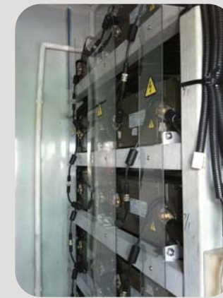
锂电池房 Battery Room